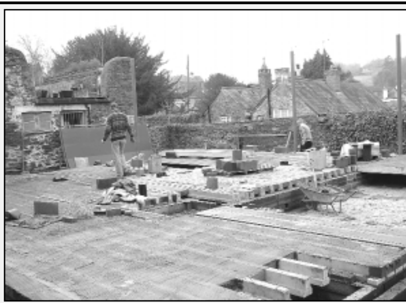
Work progresses on the Silver Street Centre