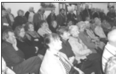
Wivey residents await the book launch