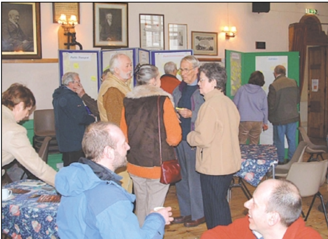
Milverton residents take a full part in planning for the future

(This is taken from a Guidance for Parish and Town Councils which was produced by the Countryside Agency)