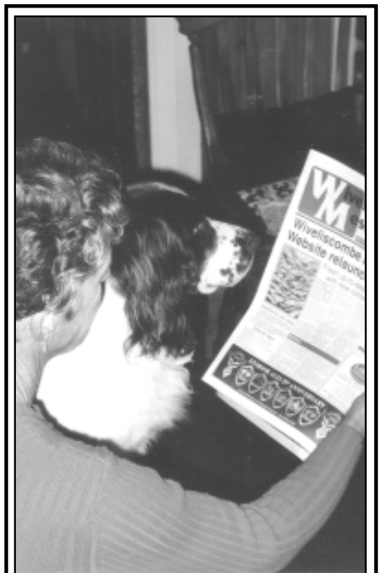
A dogged reader

2005. Upgraded children's play area built for £69,000.