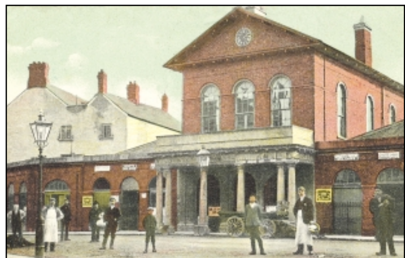
Wiveliscombe Square - one of the many little-known illustrations from the Wiveliscombe History Book