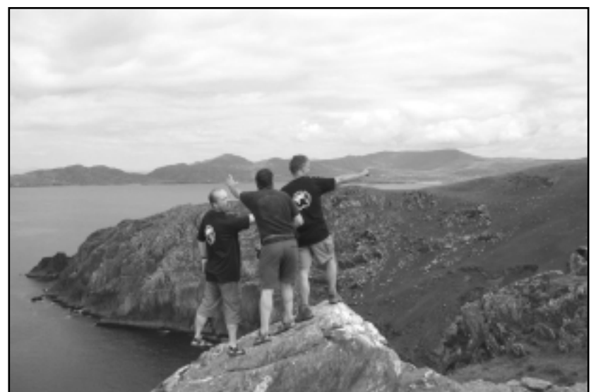
Another sighting of the world famous Wivey tee-shirt