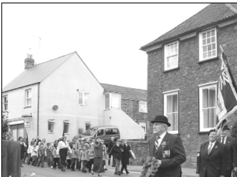
Lest we forget . . . Wiveliscombe's Remembrance Day parade